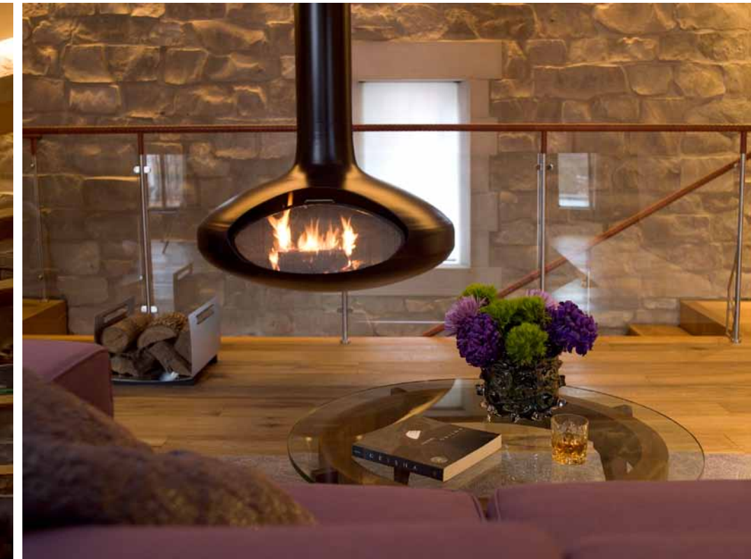
TOP RIGHT: Close-up view of Master bedroom seating area