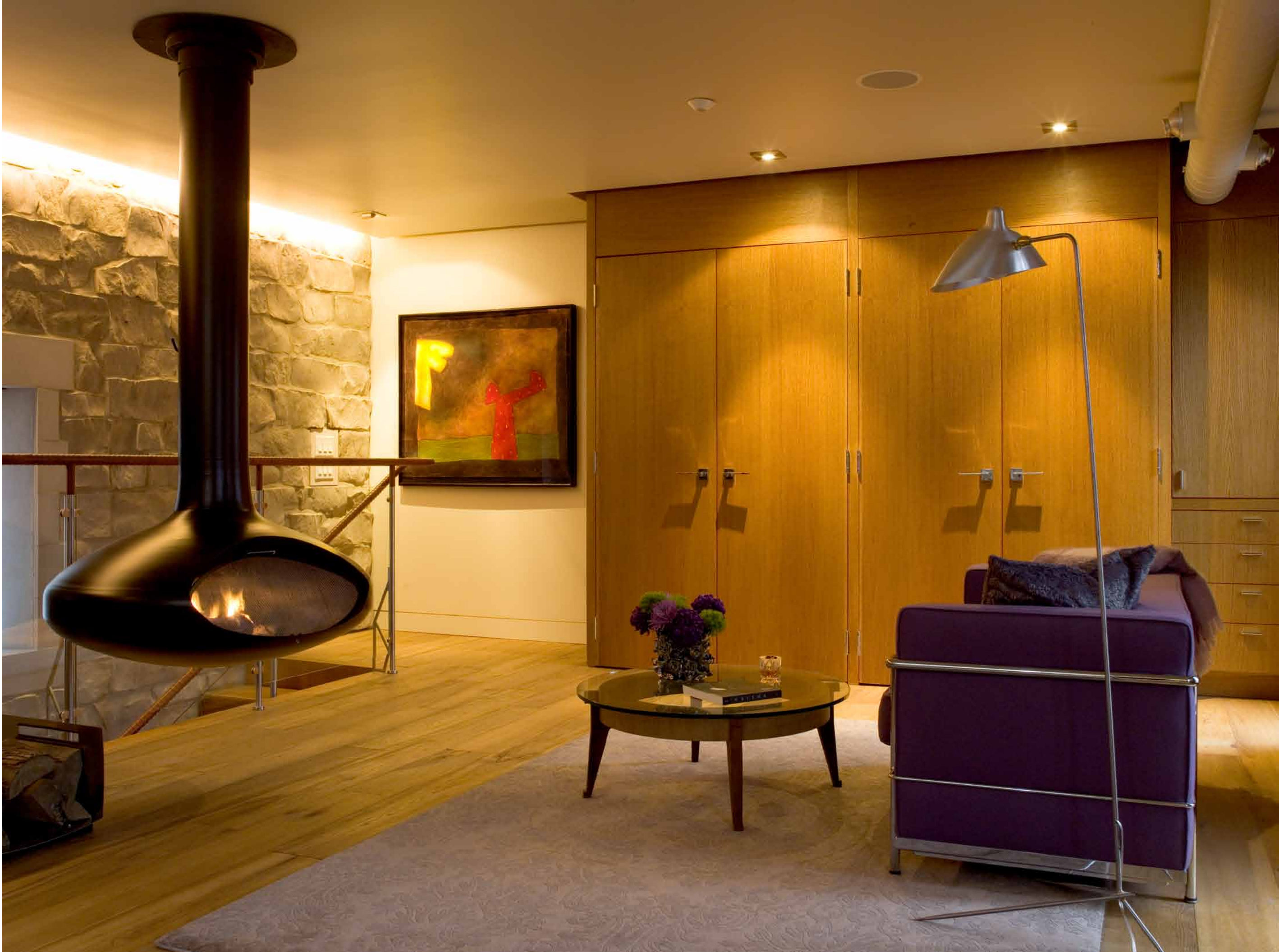
Wide view of the master bedroom sitting area with Fire-Orb hanging fireplace, mauve wool Corbusier sofa, oak and walnut SOMA Ring Table and built-in white oak closets.