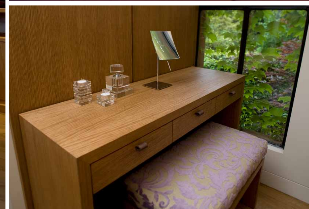
ABOVE RIGHT: Master bedroom dressing table of white oak with leather drawer pulls.