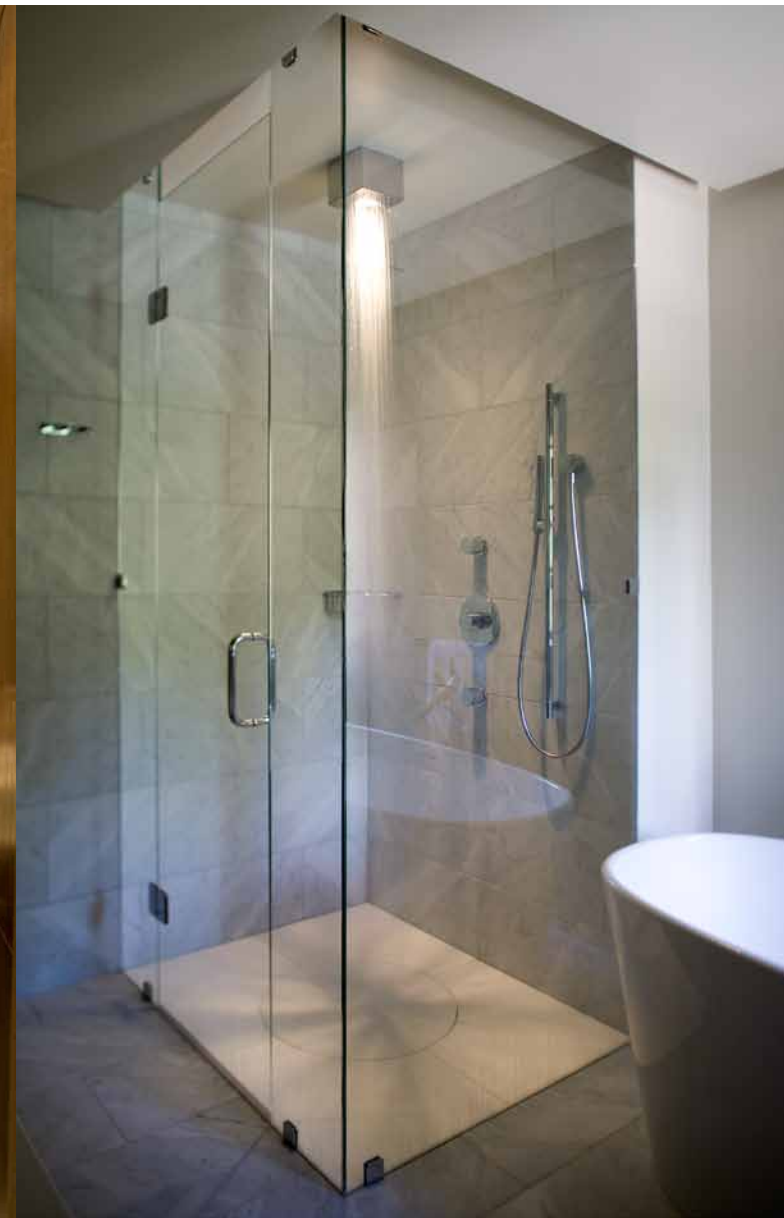
LEFT TO RIGHT: SOMA_Jo Dresser in oil-finished walnut with cast bronze hardware and brown-gold marble top. Master ensuite in walnut and carrera marble.