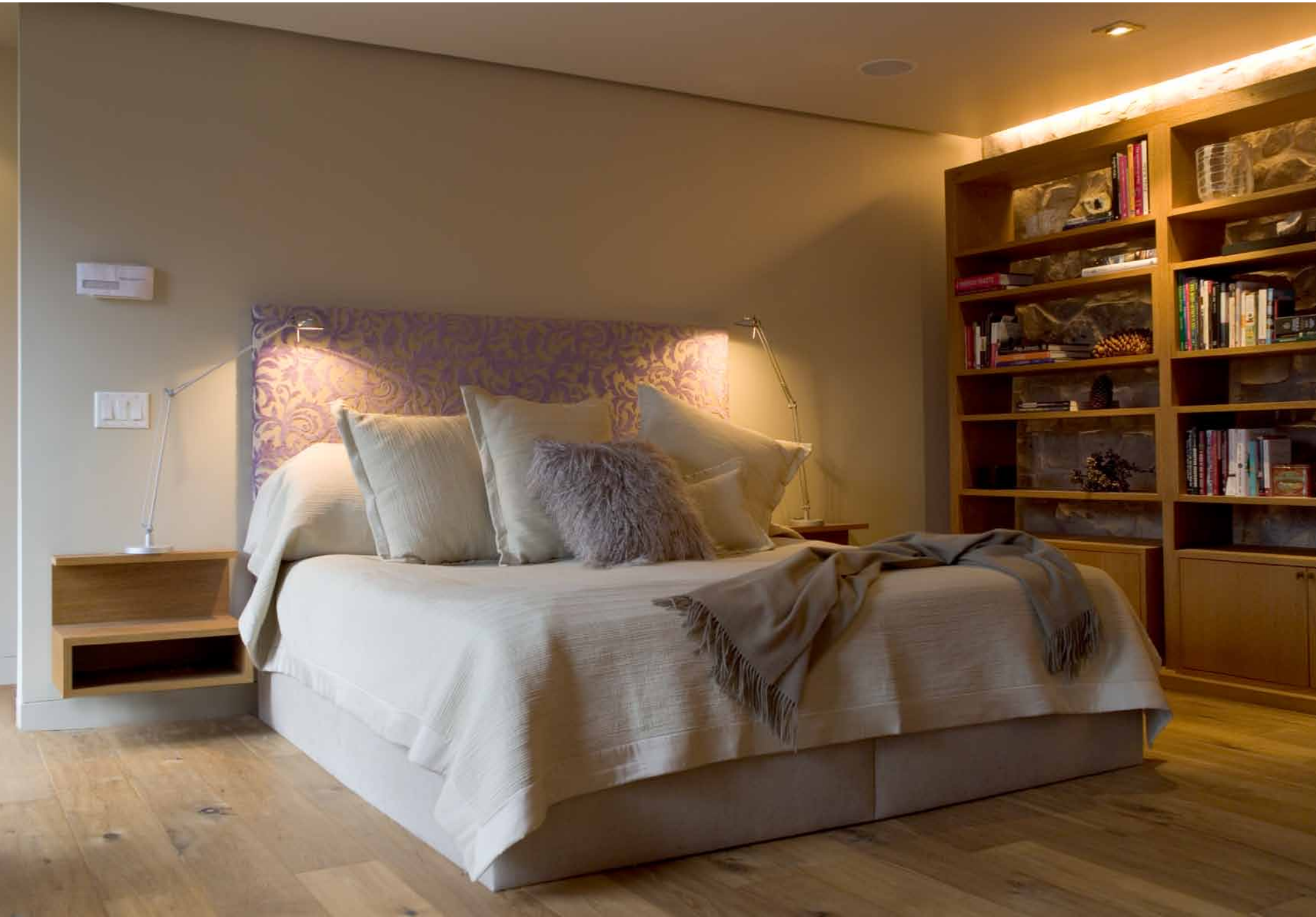
ABOVE: Master bedroom with site-specific bed, side tables and bookcase.